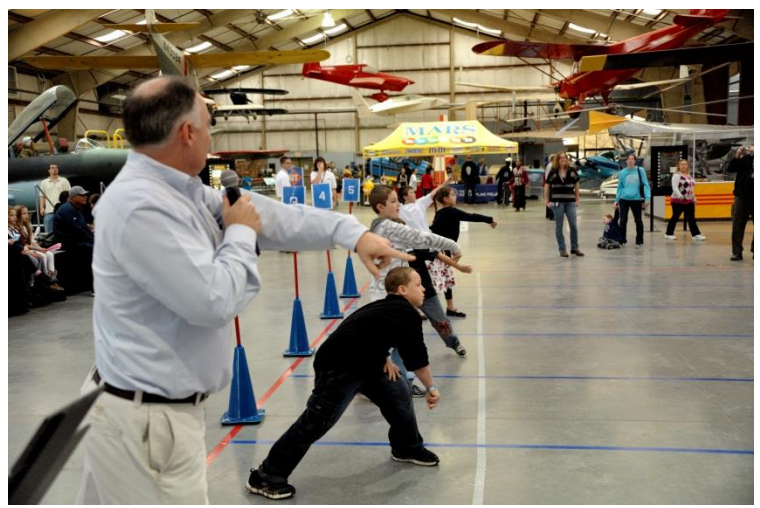
in the 2013 Great Paper Airplane Fly-off