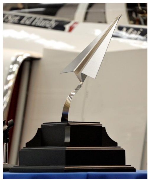
Pima Air & Space Museum.

The Great Paper Airplane Trophy on permanent display at the