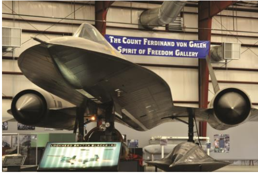
SR-71 Spy Plane